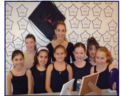
Team Jolly Joints